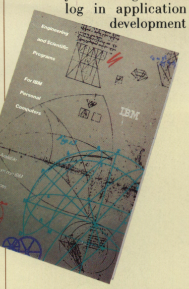
Directory of engineering and scientific programs for IBM Personal Computers.

If your department or laboratory is suffering a back-